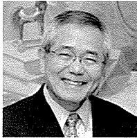
Purdue University Distinguished Professor Mr. Ei-ichi Negishi (Teijin Group Distinguished Fellow 5th year Teijin kumura scholarship (1957)