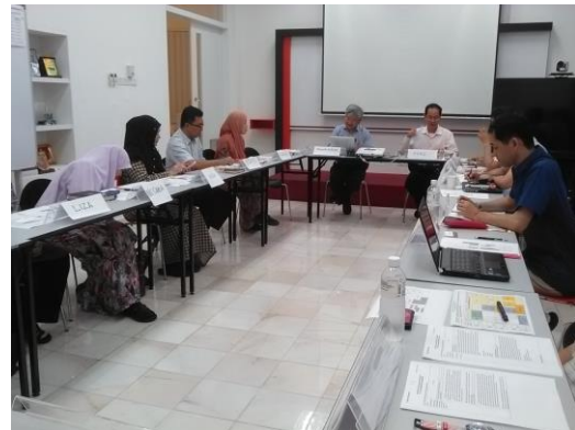
Pic.1 Meeting at TUT Penang campus

Finally, I was able to connect a lot to the United States and Malaysia through this program. I would like to express my gratitude to everyone who has received much support. I appreciate all staffs in TUT, NIT, QC, PSP, PTSB, USM and NIT, Fukui college.