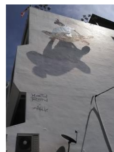
Pic.2 Art of World Heritage in Penang

Toyohashi University of Technology Institute for Global Network Innovation in Technology Education Center for International Education 1-1, Hibarigaoka, Tempaku-cho, Toyohashi, Aichi, Japan Tel: +81-532-81-5161 Mail:unireform@office.tut.ac.jp