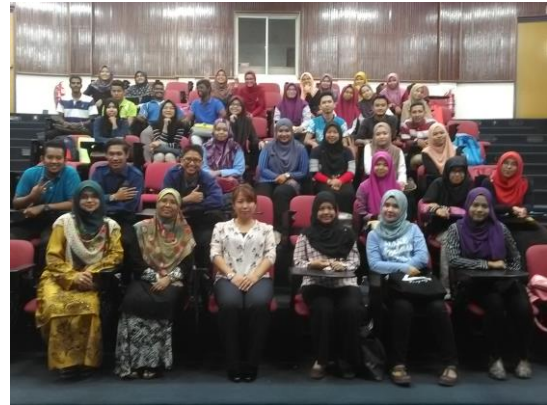
Pic.1 Photo after class in PTSB

As you know, Penang has many immigrants from Japan in recent and is comfortable to live. The one of life style which uses cheap food trucks and dinners were more common. In addition, there were many lifestyle support services that we could use easily, and it was said that it helped women's penetration into society. And then, PSP, PTSB also had a majority of female faculty members. Many female lecturers could have balanced education for kids with job, was a workable environment.