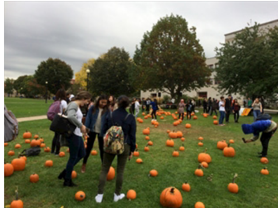
A lot of pumpkins on QC campus

Donut shop, very uncanny color donuts are sold for Halloween version. Of course, there are a lot of Halloween decorations in the Summit and the QC campus as well. The QC campus is full of pumpkins. In the Summit, many events for decorating and drawing pictures of Halloween were held, and I feel that it is a very cheerful atmosphere.