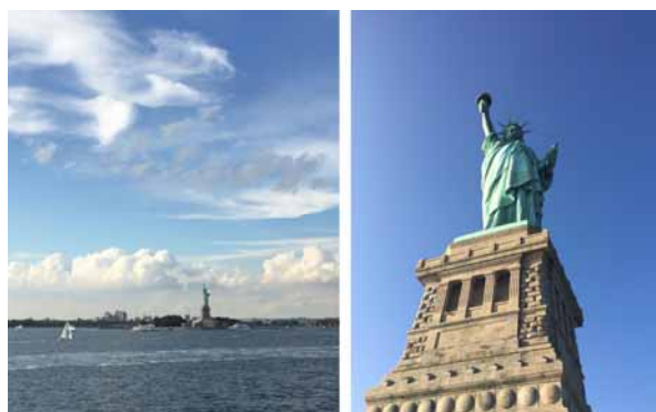
The statue of Liberty. (Left) Seen from the free ferry (8/23), (Right) Seen from Liberty island (12/5)

On that day, a subway route change made me get lost because it was unexpectedly changed. I was not aware that I had passed through Manhattan to Brooklyn. Even though I took the train going back to Manhattan again, the train did not stop at South Ferry Station, so I gave up taking the train and walked on the way to the station for about an hour. Finally, I got on the ferry. Miss Liberty from the free ferry was too small. I could not feel anything and never impressed by that. I was disappointed. At that precise moment, I thought that I could not go back to Japan without seeing the Statue of Liberty better, and I reserved the ticket to the crown of the Statue of Liberty. The number of the people who can go up to the crown in a day is set to a limit, and the ticket I got was available on Saturday, December 5, 2015. It was about three months later.