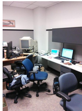
Fig.2 My laboratory