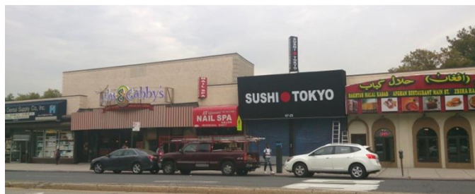
Restaurants near the University

I decided to take an ELI (English Language Institute) evening class twice a week. A day class that I took in July and August was mostly occupied by college student. In contrast, majority of evening class is salaried person. The students of evening class have various backgrounds; for instance, Korean Ukrainian barber, Colombian physical therapist, Chinese nail salon owner, novel writer, and Business manager. In this class, I strongly realize a cultural and ethnic diversity of New York. Queens College is placed in Queens which is most ethnically diverse urban area in the world. Therefore, I can see many cultural things and immigrants by just working around. The photo on the lower right shows a nearby street lined with Mexican, Japanese, and Halal restaurants. Such situation was called as Melting pot. But in recent years, it is called as Salad bowl, in which different cultures mix, but remains distinct in some aspects. I want learn the merit and demerit of multicultural society.