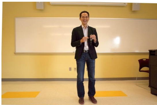
A picture of myself giving a presentation about my watch.

The teacher of the reading class was very unique man, because his explanation was based on his unique grammatical theory which I had never heard. For example, “Past tense expresses not only the events happened in the past but also the separation from reality,” “Native English speakers are always obsessed with numbers (singular/plural),” or, “Tenses and Time Flashes are different concepts,” he said. Though they were very difficult to understand, a lot of ideas which I could really appreciate and admire were included in his words. The amounts of the assignments of his class were huge. They were not only the preview of the articles used in the class but also summarizing articles of New York Times and writing my opinions about them, vocabulary learning, etc.