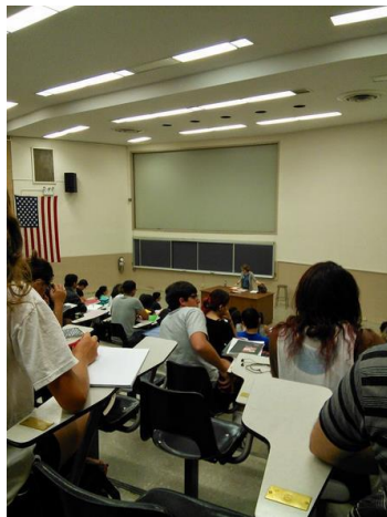
Fig. 1 class in session

The most important task is to improve English skills. Every day, I am watching drama with no subtitle, doing free conversation, writing diary, reading newspaper in English. This year is special and precious for me, then, I would like to spend every minute of every day.