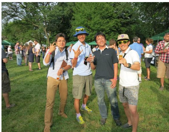
Photo 2 Beer Fest in summer, author is at right

colleagues and refresh my exhausted mind (Photo 2).