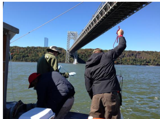
Photo 1 Survey at Hudson River

overflow, discharges with storm water runoff to Hudson River, because a combination sewer system operates in NY City. He evaluates the mechanism of the emission of these gases affected by CSO, and his research relates with the climate change owing to these gases have a highly potential of green house gas. I went to the river cruise survey with them to do experiments with uncomfortable waving on the ship (Photo 1).