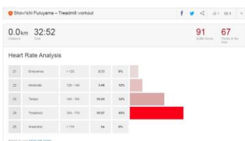
Heart Rate Data

It has been two months since I wrote last QC letter. I have kept well-regulated life such as getting up at 4am and going to bed at 10pm. I also spend at Gym for one hour every day. Nowadays I usually use the treadmill and record the heart rate data like as the following graph. It looks healthy activity but sometimes I can see Pegasus by the Glute training mode (30 minutes and 7.5 miles/h pace). I am not sure it is healthy or not but my athletic performance has been improved. Supplements such as amino acid, creatine and protein are very popular in US. They are very attractive for me. I tried various supplements like as a photo for my health. I am sure I will be able to fight with Ebola and of course defeat it by training these activities and taking these supplements.