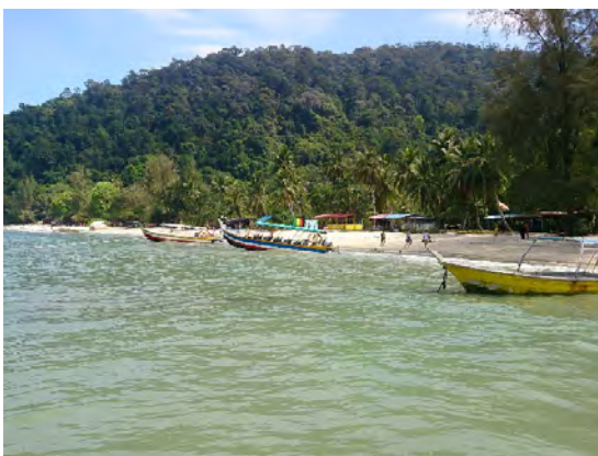
Fig.3 Monkey beach