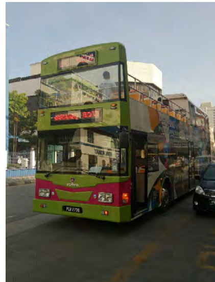
Fig.2 Hop-On Hop-Off Bus

Toyohashi University of Technology Institute for Global Network Innovation in Technology Education Center for International Education 1-1, Hibarigaoka, Tempaku-cho, Toyohashi, Aichi, Japan Tel:+81-532-81-5161 Mail:unireform@office.tut.ac.jp