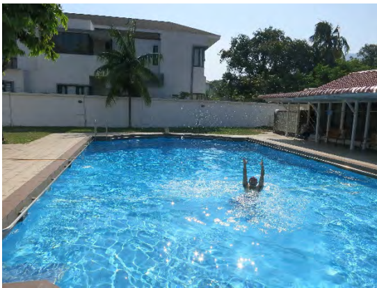
Fig.1 Reservoir in Penang Campus

If Penang is a resort on south island, we need beaches; however, you do not be afraid. Penang has beaches on the north part. There is a national park in Penang. It has two beaches. If you want to go there, you can choose way by work or took a boat. If you go there by your foot, you will work about two hours with looking native trees and animals. If you take a boat, your boat fly to sky. These beaches have hammocks, seat swings on a tree and beautiful sand. I strongly recommend you should go there.