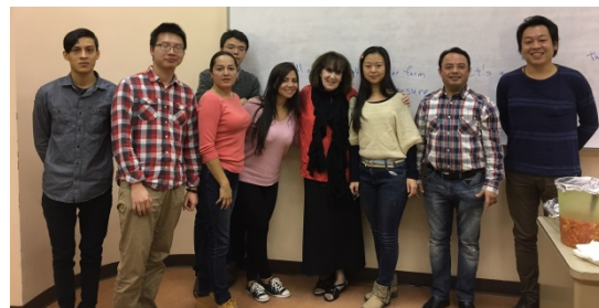
Farewell party in Fall English class

I am the first person from Nagaoka University of Technology to attend this program. Thus, at first, I was hesitant about participating because I could not get the entire image of the program. However, it was a right decision for me. I strongly hope to continue this program as one of participants.