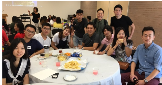
Farewell party in Summer English class

often felt stressed, especially during daily conversations, rather than my discipline. Even though this issue persists, I do feel like I'm able to speak English more smoothly than I did in the past.