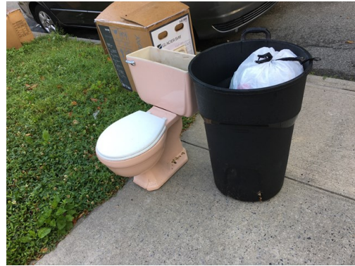
Fig. 2 Household wastes on the roadside

The differences between NY and Japan mentioned here are some that I noticed. I want to come across more in my remaining month here.