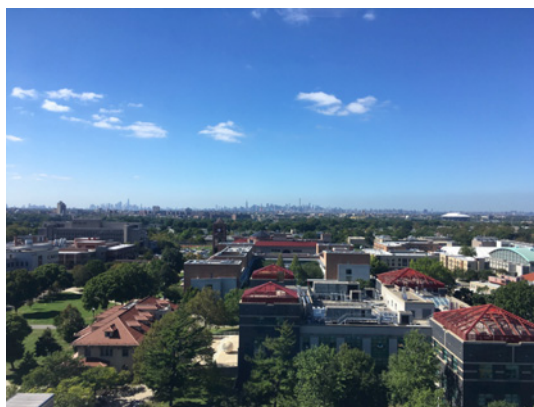
A prospect from the highest floor in Queens College to Manhattan Island, 5th October 2016

Every summer from the end of May to August is a summer term in QC. I heard that some QC students will study abroad or will take an internship at a company during the term. Ten students from the City University of New York (CUNY) 4 including QC also used the term so as to study at Toyohashi University of Technology, Japan, from the end of May to the middle of June. However, QC accepts students